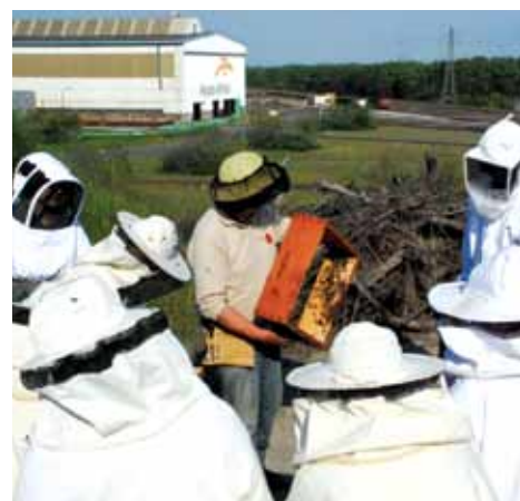
Volunteer beekeepers, employees of ArcelorMittal