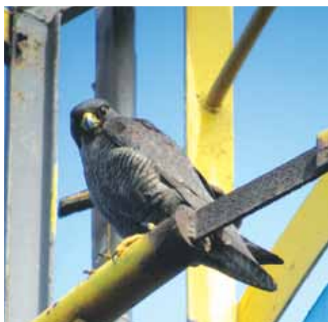
Peregrine falcon at the cokeworks in Dunkirk

For example, a bird sanctuary is home to some hundred species of birds. The site accommodates exactly 136 out of the 400 endangered species in Europe. For the past 2 years, a pair of Peregrine falcons has been nesting at the level of the Dunkirk Cokeworks, an exceptional phenomenon followed closely by ornithologists. This couple produced offspring. They later moved on, only to be replaced by a new pair who recently settled into the same location.