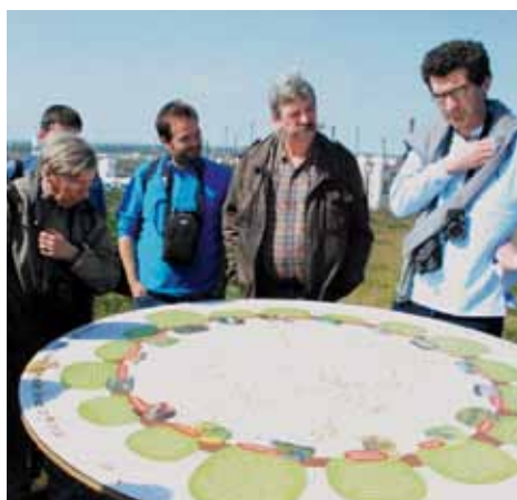
On the Biodiversity Trail circuit