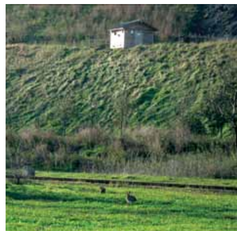
The hive on the green hill at the Dunkirk site

Such results are the legacy of ArcelorMittal’s active pursuit of a balanced relationship between the industrial sector and the environment; its continuous effort towards ‘transforming tomorrow’, the natural way.