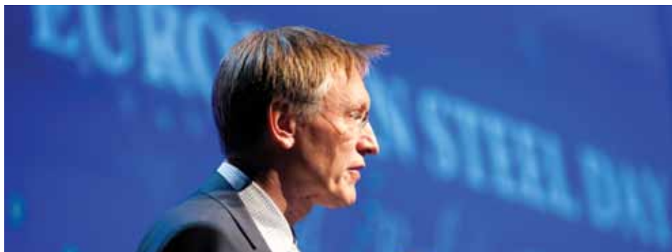
Janez Potočnik speaking at the Conference

Competitiveness, innovation and the life cycle benefits of steel were at the heart of the European Steel Day in Brussels. The event brought together 400 representatives from the European institutions, EU member states and EU steel industry as well as a number of high level journalists.